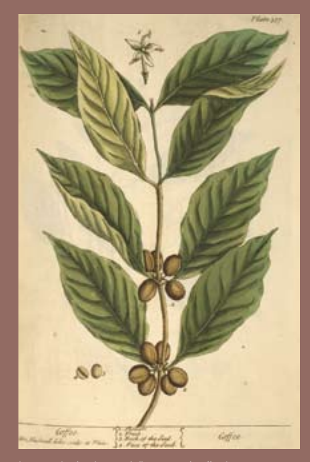
In 1739, the first botanical illustration of coffee by a woman was published. Elizabeth Blackwell produced two volumes of 500 plates. She modeled her pictures on live specimens at the Chelsea Physic Garden in England. Her book was titled A Curious Herbal, Containing Five Hundred Cuts, of the Most Useful Plants, which are now Used in the Practice of Physick: Engraved on Folio Copper Plates, after Drawings Taken from the Life.

tions undoubtedly affect the taste of coffee, of paramount importance among the many variables is the processing of the harvested berries.